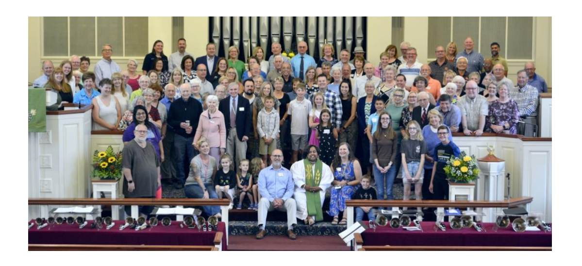
9:00 Worshippers – Modern and Traditional

The Staff enjoyed its first monthly lunch together on September 20. This new practice, again with the support of SPRC, recognizes the importance of table fellowship on a regular basis for maintaining a strong, high functioning, healthy staff team. The lunches will also be an opportunity to celebrate birthdays and anniversaries.