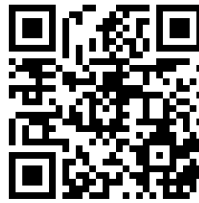
Scan to Read the Weekly Update