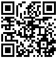
Scan to Read the Weekly Update