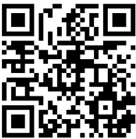
Scan to Read the Weekly Update