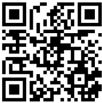
Scan to Read the Weekly Update