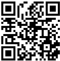
Scan to Read the Weekly Update