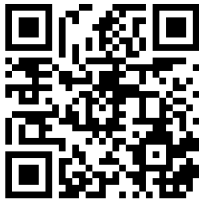
Scan to Read the Weekly Update