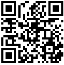
Scan to Read the Weekly Update