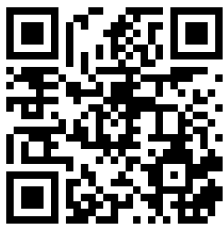
Scan to Read the Weekly Update