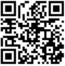
Scan to Read the Weekly Update