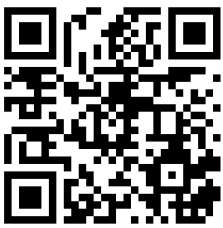
Scan to Read the Weekly Update