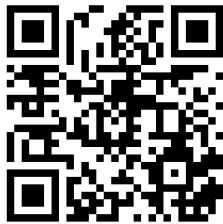
Scan to Read the Weekly Update