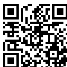
Scan to Read the Weekly Update