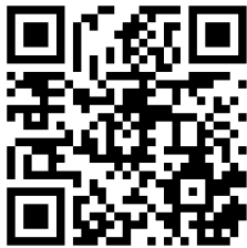
Scan to Read the Weekly Update