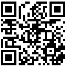
Scan to Read the Weekly Update