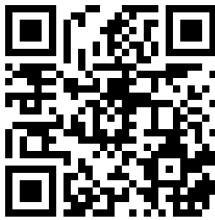
Scan to Read the Weekly Update