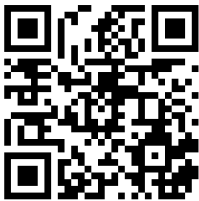
Scan to Read the Weekly Update