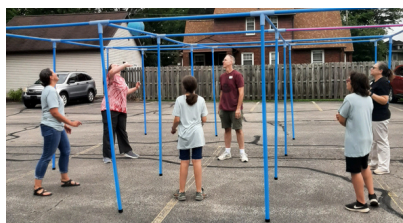
Youth Group Mashup