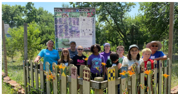
MS Mission Week