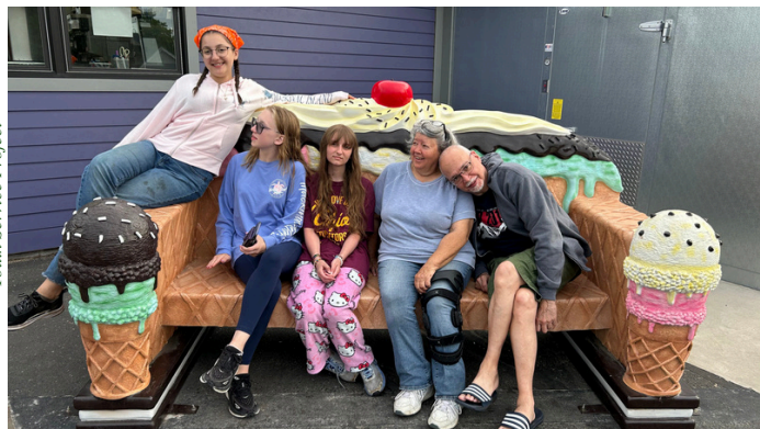
Youth Service Project