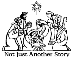
Not Just Another Story